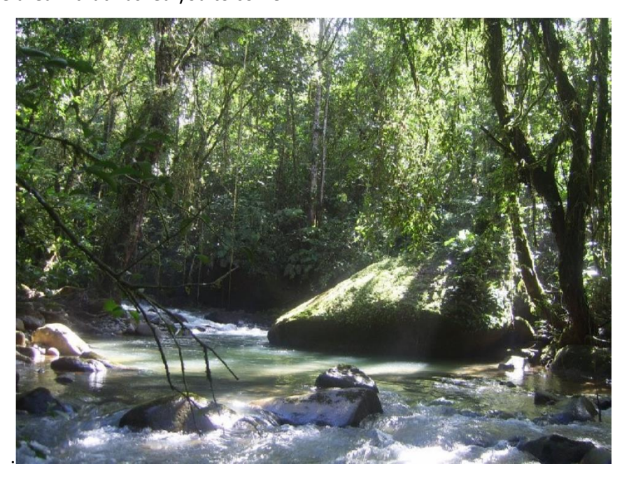
The River Sonador near Pasiflora

Not only you, but also the population of Longo Mai benefits from cross-cultural exchange. Many people here do not have the opportunity to travel (low incomes). Television creates false impressions, tourists usually convey the only real images of their respective countries. Longo Mai frequently supports teenagers from the village who want to get to know the world – villagers that have the same dream that has led you to come.